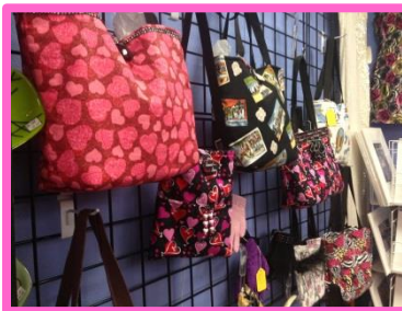
Totes and cute bags with heart prints are more great gift ideas...